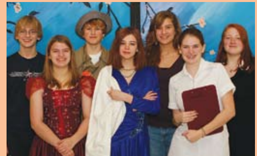
Cast members of the TC Prep original school play, "The Omelet Mystery."